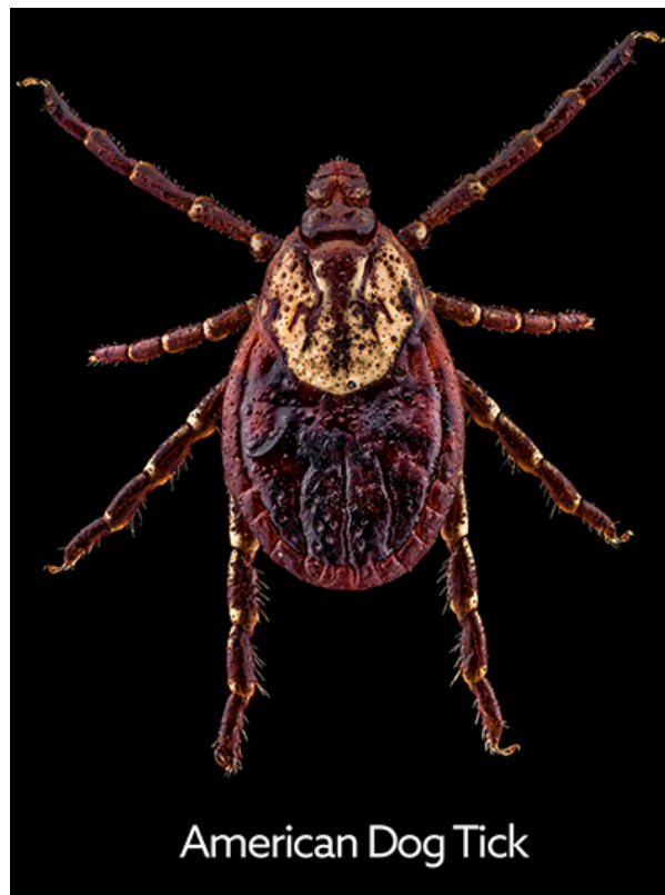
American Dog Tick

The American dog tick requires from three months to three years to complete a life cycle. It typically is dependent on climatic and environmental conditions for its eggs to hatch.