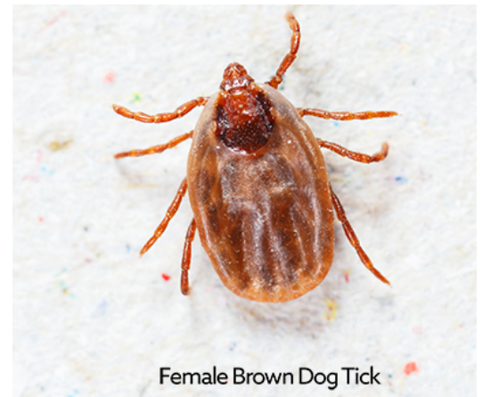
Female Brown Dog Tick

The adult is reddish-brown and usually attaches around the ears or between the toes of a dog to feed. After feeding, a female may engorge to 1/2" (10–12 mm) long. She then drops off the dog and crawls into a hiding place where she may lay as many as 5,000 eggs. This tick is tropical in origin and does not survive long, cold winters outdoors.